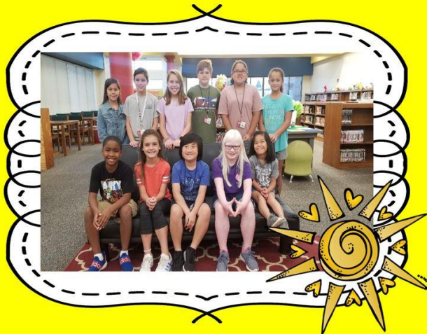
4 th Grade Model Students for August 2019