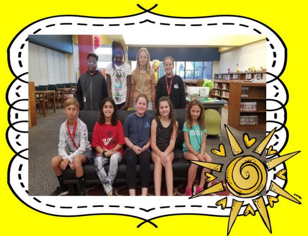
5 th Grade Model Students for August 2019